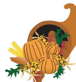
Thanksgiving Nov. 22