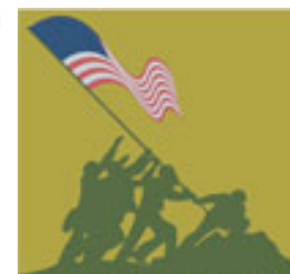
Veteran's Day Nov. 11