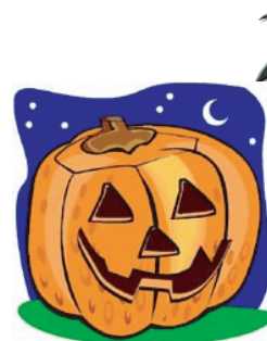
Halloween Oct. 31